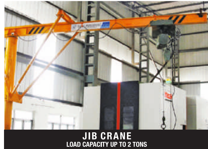
JIB CRANE LOAD CAPACITY UP TO 2 TONS