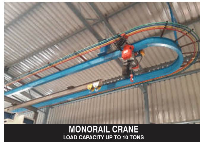
MONORAIL CRANE LOAD CAPACITY UP TO 10 TONS