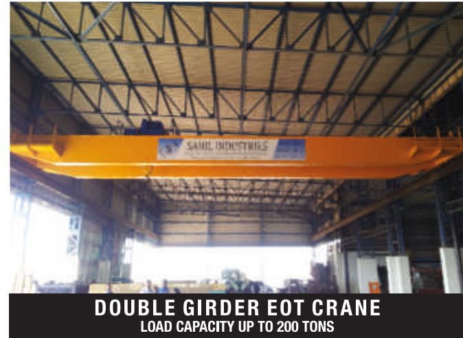
DOUBLE GIRDER EOT CRANE LOAD CAPACITY UP TO 200 TONS