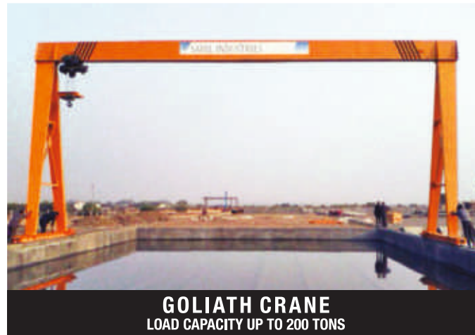
GOLIATH CRANE LOAD CAPACITY UP TO 200 TONS