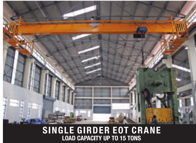
SINGLE GIRDER EOT CRANE LOAD CAPACITY UP TO 15 TONS