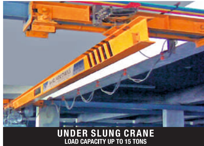
UNDER SLUNG CRANE LOAD CAPACITY UP TO 15 TONS